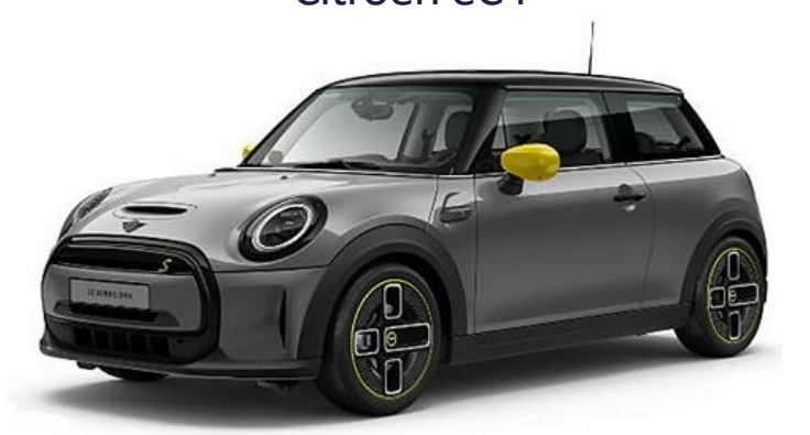
Mini Cooper SE