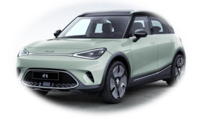
SMART Number One